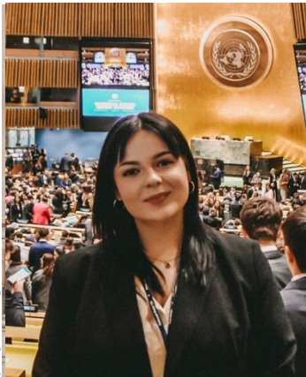
Training Officer Political Science