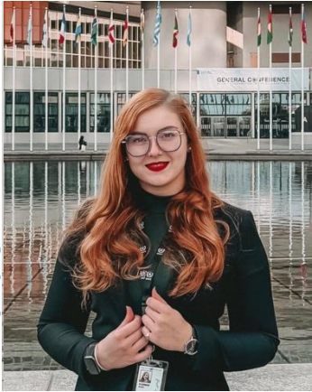
Project Lead Physics