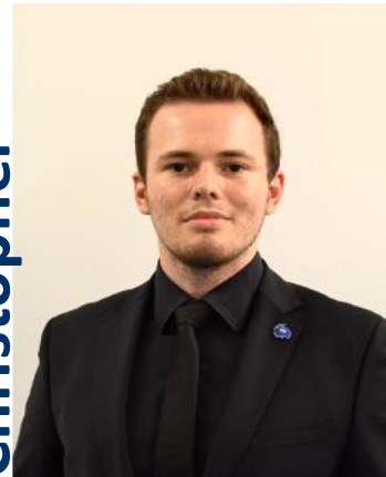
Training Officer English and American Studies