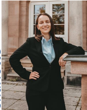
Welfare Officer Education Studies for English, Latin and German