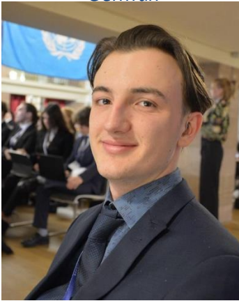
Training Officer Political Science